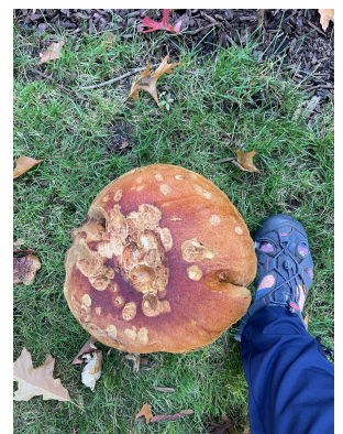
From Lina De Fournay by the Good Flower Med

Shredded paper creates a huge mess at the recycling sorting facilities. Even if shredded paper was contained in a paper bag and the bag managed to stay intact by the time it arrived at the recycling sorting facility, employees at the sorting facilities were required to open the bag to look inside. The paper would fly everywhere and most of it would land on the floor where it was swept up as garbage or end up